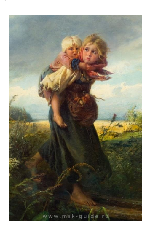
Задание 5. «Дети, бегущие от грозы», Константин Маковский

In which dialogue are the children talking about this picture? Dialogue __6__